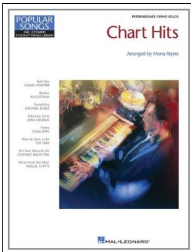
CHART HITS INTERMEDIATE PIANO SOLOS POPULAR SONGS HLSPL Format: Softcover